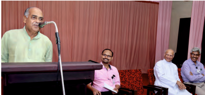
Foundation Day Lecture by Justice Cyriac Joseph