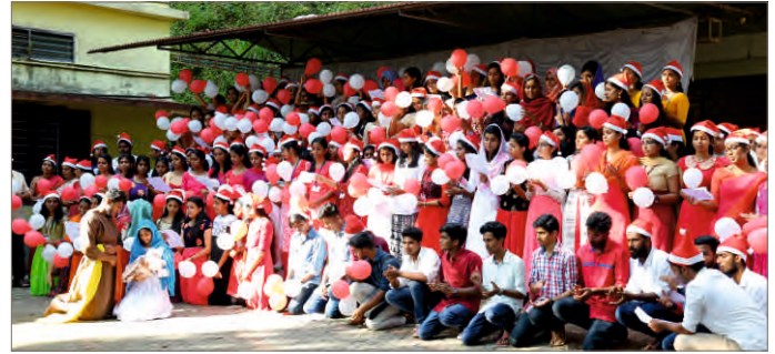
College Christmas Celebration- Joy to the World!