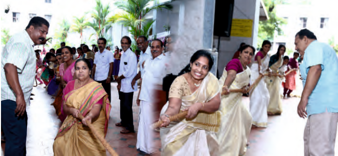
Trial of Strength - Tug of War between teachers and non teaching staff