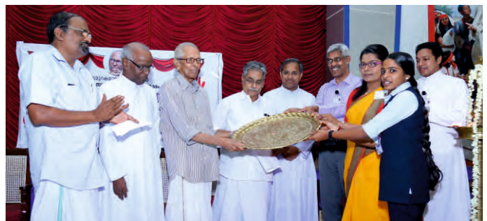
Honouring Prof. M.K. Sanu the literary Lion of Kerala Nirmala Alumni Association