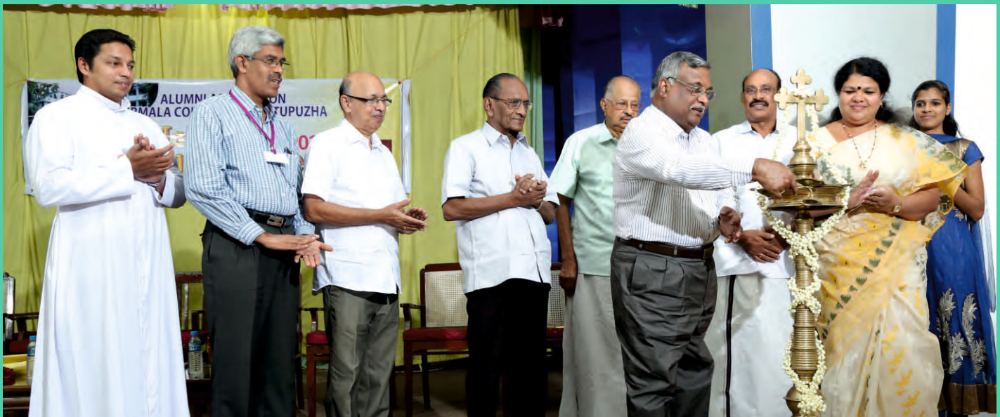
Mega Alumni Meet 2017 Inauguration by Justice V.K. Mohanan