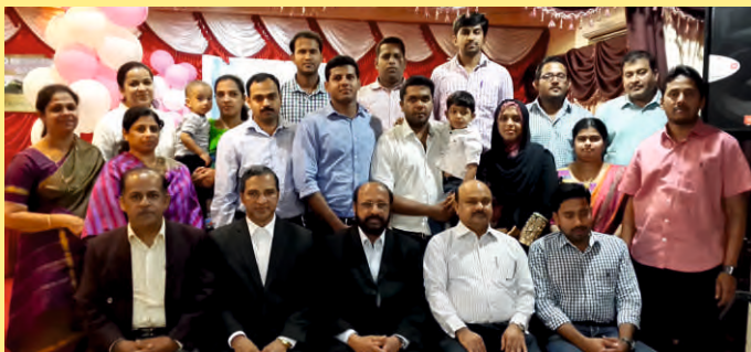
Our Qatar Chapter

Our Alumni Association has chapters in Germany, UAE and Bahrain. Regular activities have been going on in all the chapters and they are in touch with the Nirmala Alumni Association.