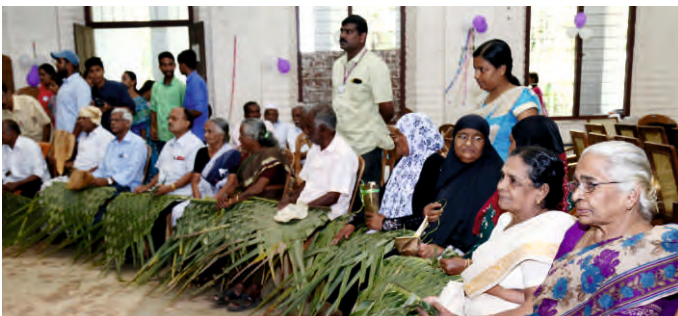
Colourful 'Vayomithram' - in collaboration with the Muvattupuzha Municipality