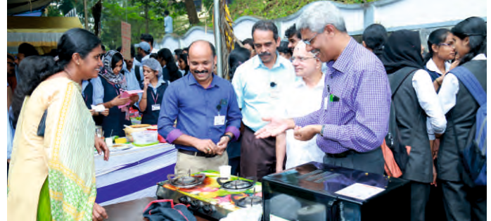
The Food Fest