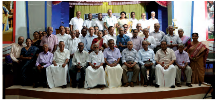
Group of former students- Alumni Meet 2017