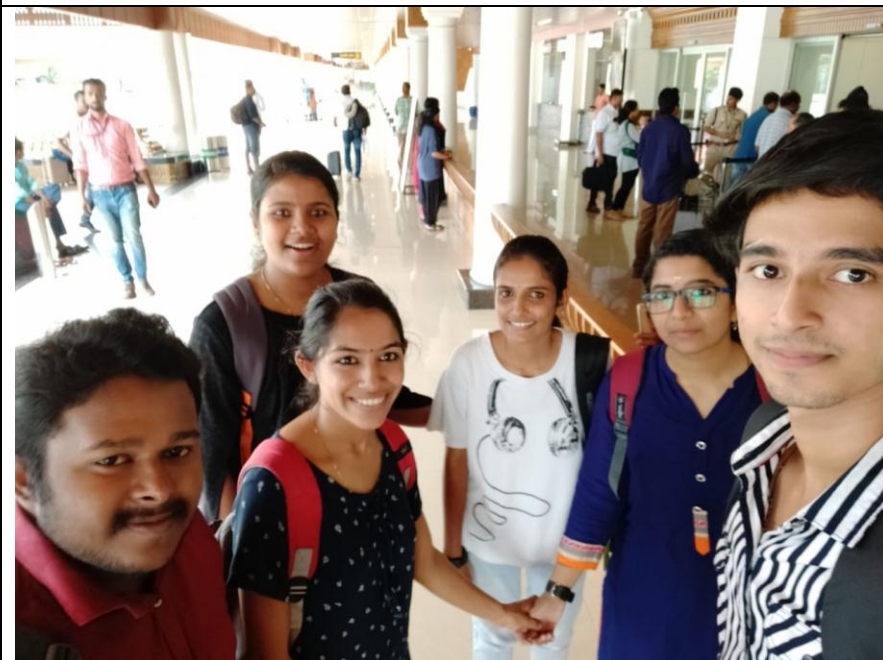
CIAL Learning Programme

The objective of the programme is to create a bridge, a platform for the students to work in cross functional teams with a broad objective of enhancing their leadership skills and giving back to the nation. In the process, the students work in leadership roles while operationalizing projects