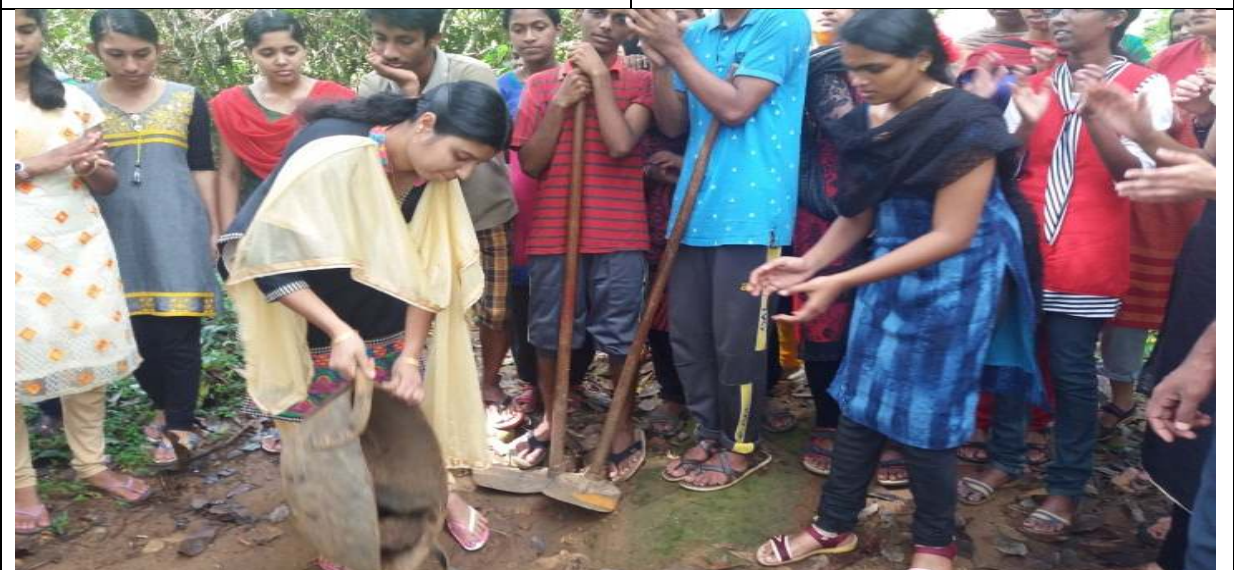
Renovation Of Rural Roads During The Special Camp At Peringassery