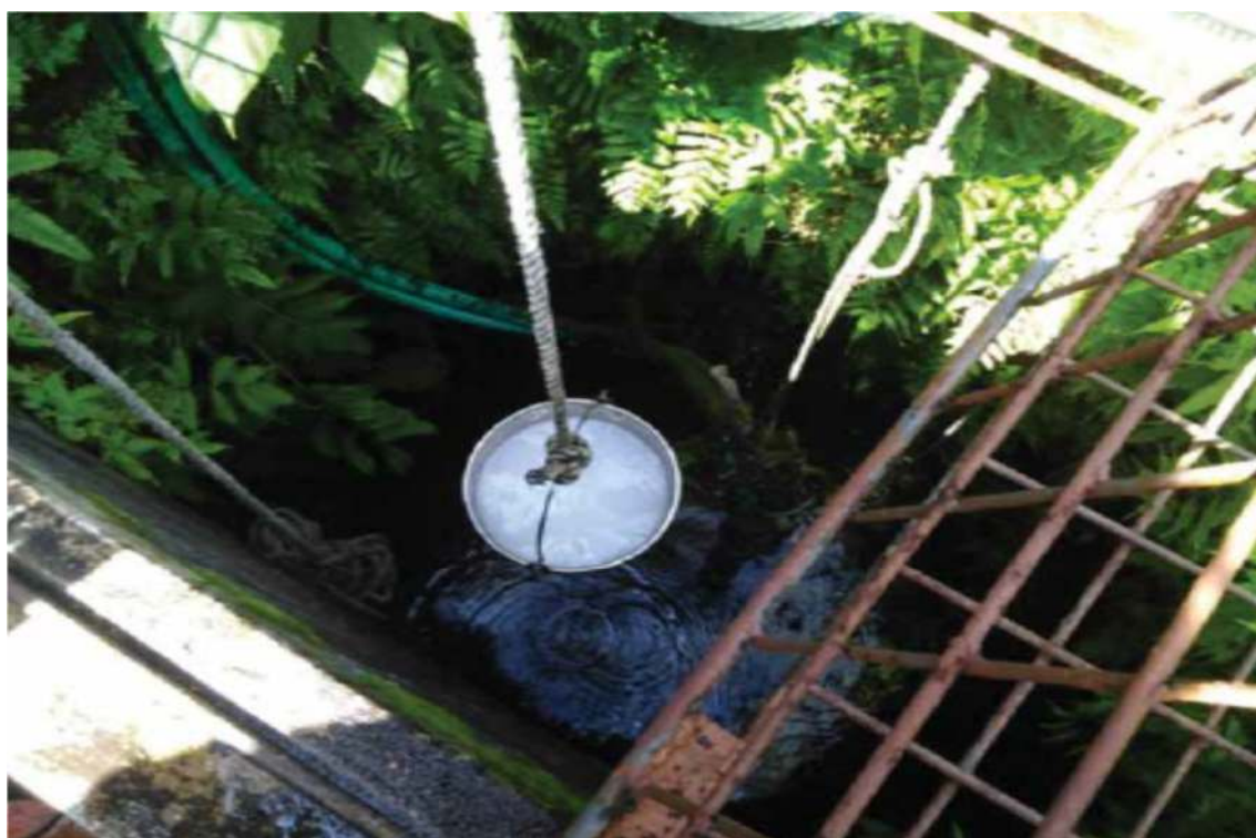
Chlorination Of Wells At Avoly Panchayath And Muvattupuzha Municipality