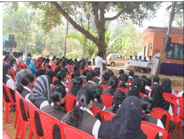
Sacred Grove Conservation Workshop And Biodiversity Documentation Programme At Nagappuzha