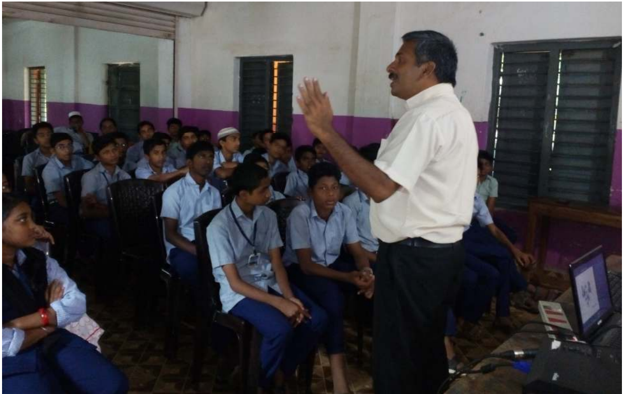
PI Is Taking A Session On Butterfly Conservation In Govt HSS Pezhakkappilly