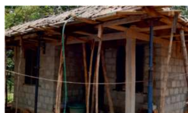
Construction Of Houses For The Flood Victims