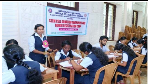
Stem Cell Donation Awareness And Donor Registration Camp