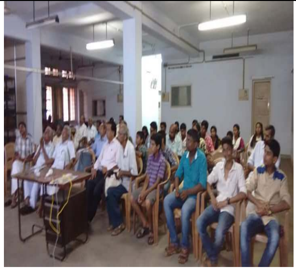
LED Fabrication Workshop At Jawahar Bhavan Thodupuzha