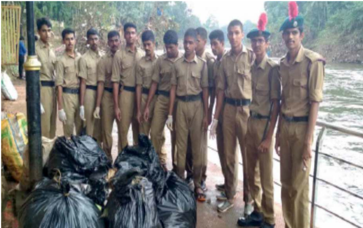
Cleaning Of Muvatupuzha Riverside Walkway By NCC Cadets