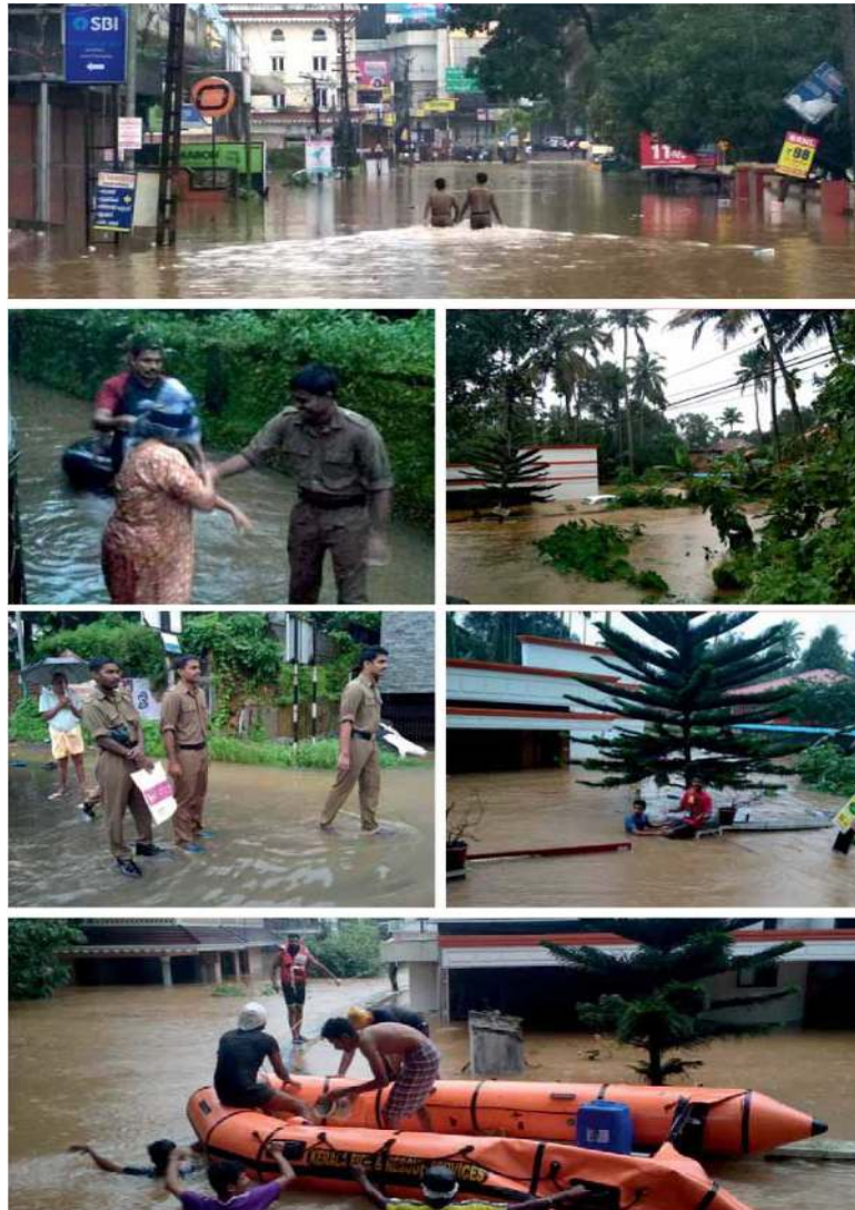
Camp Visit, Rescue Mission And Relief Camp At Velloorkunnam, Muvattupuzha