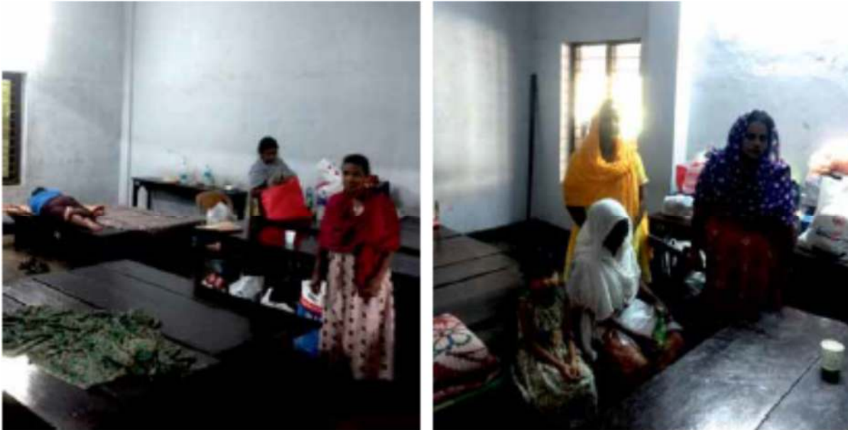
Flood Relief Camp At Nirmala College, Muvattupuzha

NCC, NSS and CSM of Nirmala College, Muvattupuzha helped to conduct relief camps in the campus under the guidance of teachers and the management. There were 131 members in the first day of the camp including local villagers and people from faraway places and districts. The students took special care to attend to the needs of all the members in the camp. Different religious organisations like KCYM, Yuvadeepthy, parish committees, various political parties and NGO Organisations, former NCC cadets of Nirmala College, College Alumini and students of the institution helped conduct of the camp by supplying food, groceries and necessary amenities. Around 350 students volunteered the programme