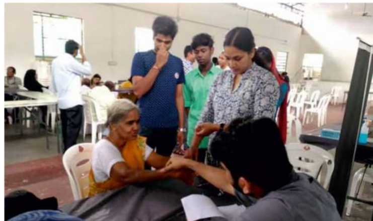
Medical Camp Conducted By NSS Volunteers In Coordination With Malayala Manorama