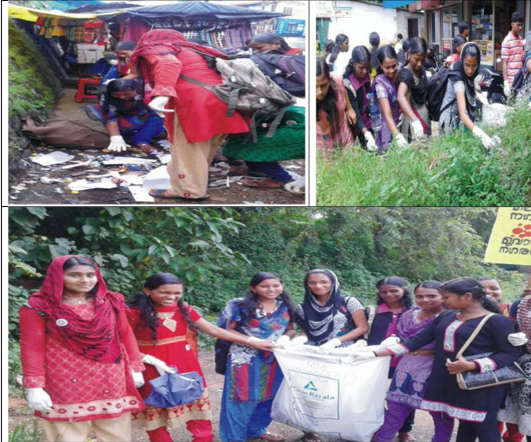
Clean India Mission Programme At Muvattupuzha