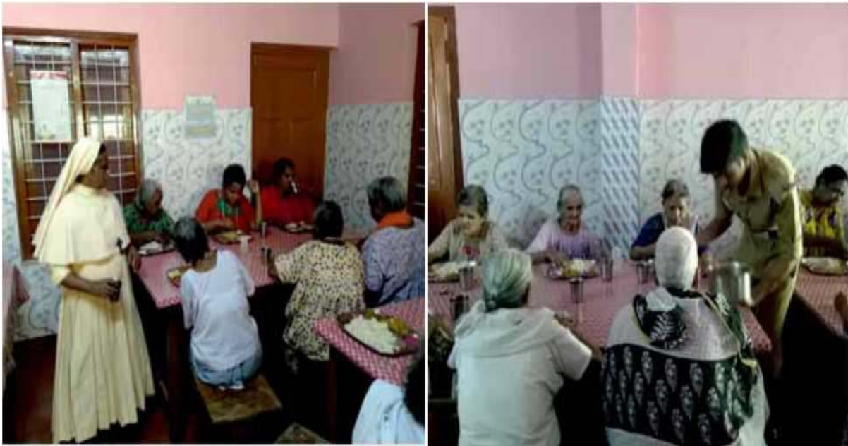
Mid-Day Meal Programme

Respecting and caring for our Elders' is one of the moral values which must be inculcated in the minds of youth. In the light of the same, on 14th November 30 cadets of Nirmala College NCC COY visited Shanthibhavan, Vazhakkulam, an old-age home. Food was also provided to needy in general hospital Muvattupuzha. Cultural events were conducted by the cadets in the morning and food was served to the inmates at noon.