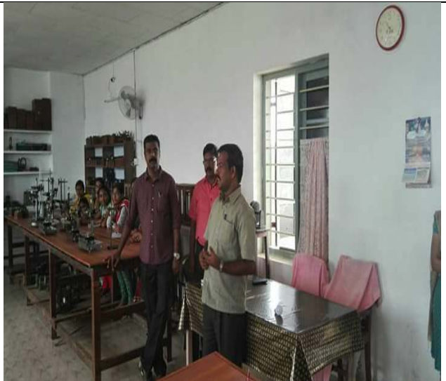
LED Fabrication Workshop At CSS Thodupuzha