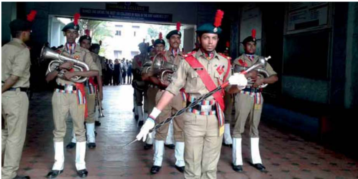
Band Training To Differently Abled Pupil At Nirmala Sadan

With an aim to impart vocational training to the differently-abled, the NCC team of nirmala college gave training to differently abled children of nirmala sadan, a special school nearby. The cadets taught the children very patiently and the pupils of nirmala sadan enjoyed it very well. The key objective of the programme is to ensure employment for the differently-abled and providing them with economic independence.