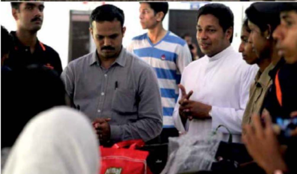
Onam Kit Collection And Distribution As A Part Of Flood Relief