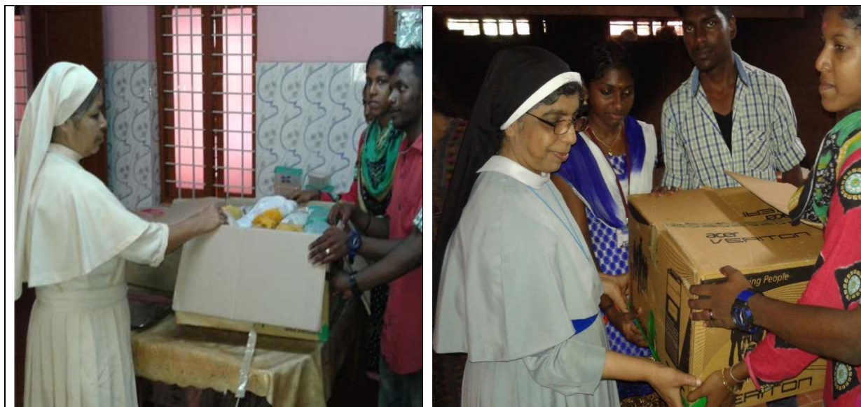
Food packets distribution to Vimala Bhavan Anikadu and Snehagiri, Vazhakulam