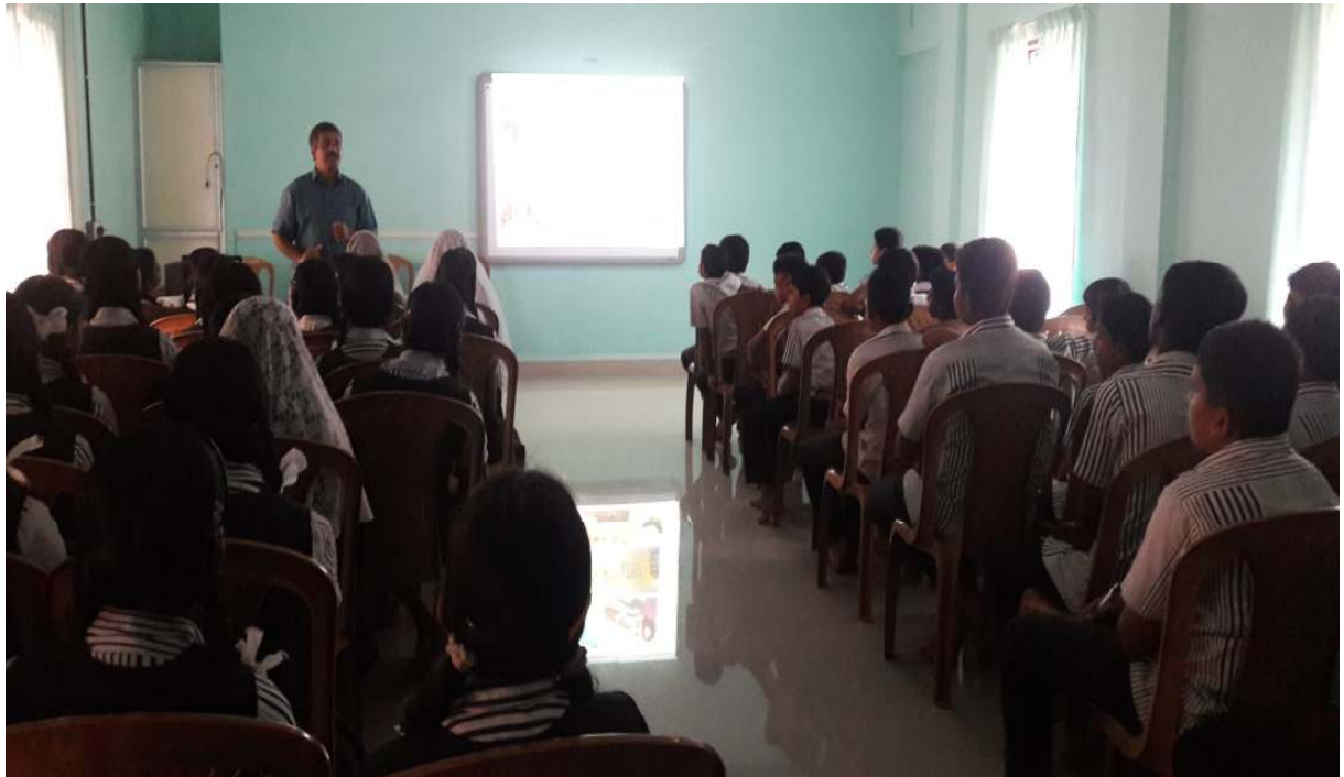
Butterfly Conservation Awareness Programme In Various Schools