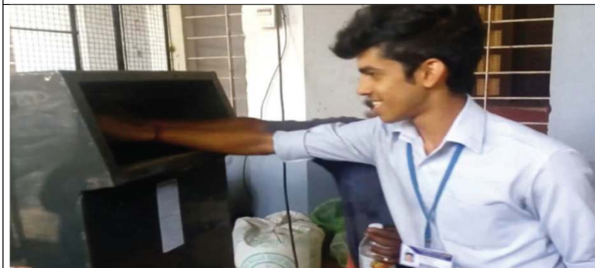
Plastic Shredding Unit by The Department of Chemistry

The Department of Chemistry had installed a plastic crushing unit in the college with the objective of making a Plastic Free Campus. The students of NSS brought plastics from their houses and arranged a collection campaign in the college. The collected plastics were later crushed with the help of the machine and used the same for tarring the roads in the campus.