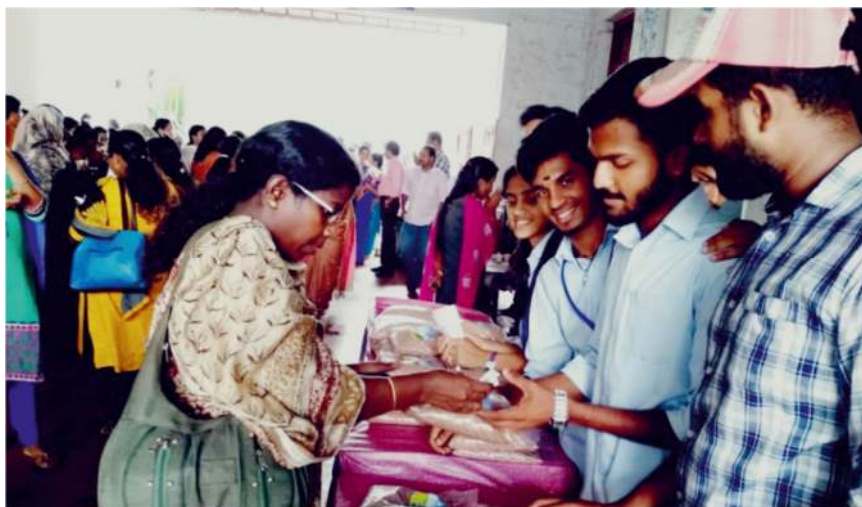
Paddy Cultivation- Sale