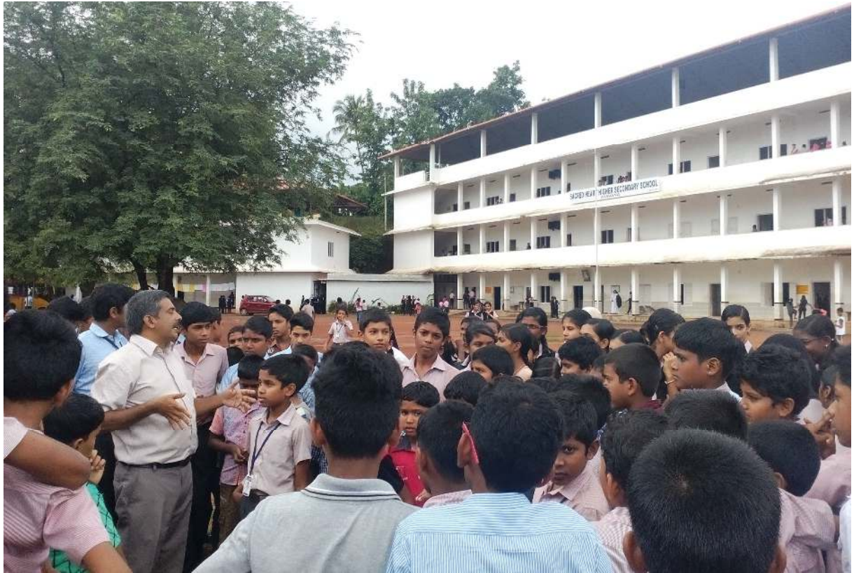
PI Is Interacting With Students Of SH High School Ayavana