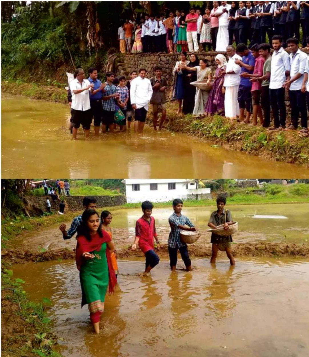
Stage 2-Paddy Cultivation; Sowing

an interesting part in the story. The field was ready for receiving seeds after it covered in water of around 2.5 cm. There was no hesitation among the volunteers in the task, and with mutual cooperation and strength of togetherness they made it easy .One Week later, again the volunteers came up to further processing of land to be fertile by sprinkling urea and slaked lime. The “njarivalikkal” was made on this day by the strong and active volunteers themselves. All of these sincere efforts lead to preparing a very suitable situation of the land for sowing.