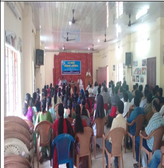
LED Fabrication Workshop At Idukki Block Office, Thadiyampadu