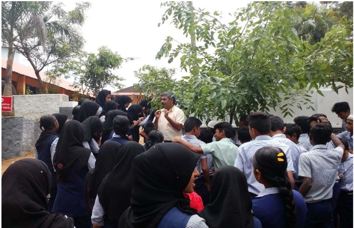
Students Of Govt HSS Pezhakkappally Are Interacting With PI