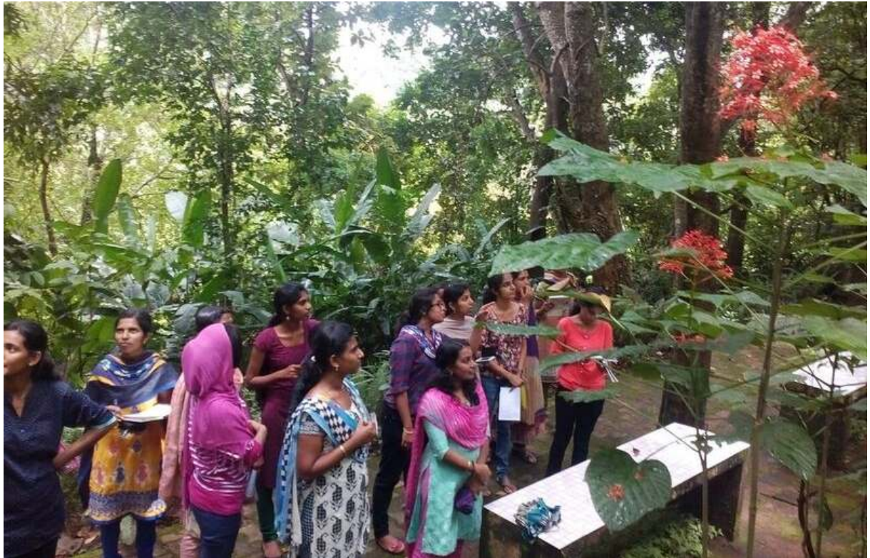
Students Of Nirmala College Are Visiting A Butterfly Garden At KFRI Peechi