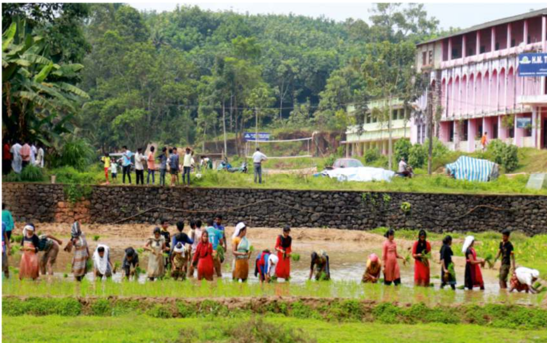
Stage 3-Paddy Cultivation; New hopes by transplanting seeds