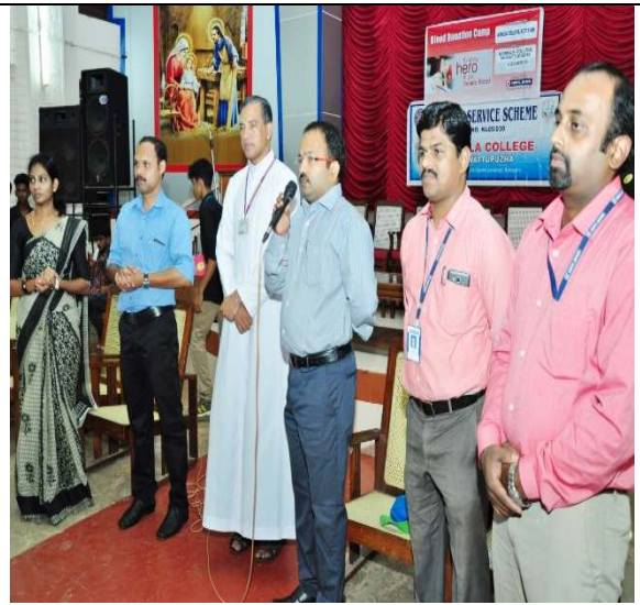
Blood Donation Camp at Nirmala College