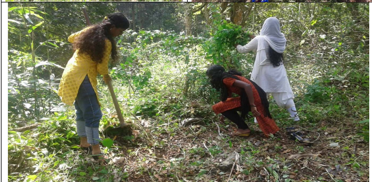
Cleaning Of Public Well And Its Surroundings In Vellaramkuthu

To improve access to safe and clean water for the tribal community, NSS volunteers of Nirmala College, Muvattupuzha cleaned the public well and its surroundings in Vellaramkuthu Tribal Settlement. The initiative was undertaken as an effort to protect every available public water sources.