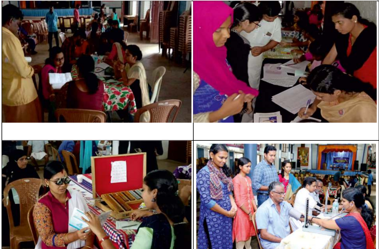
SANJEEVANAM - FREE MEDICAL CAMP