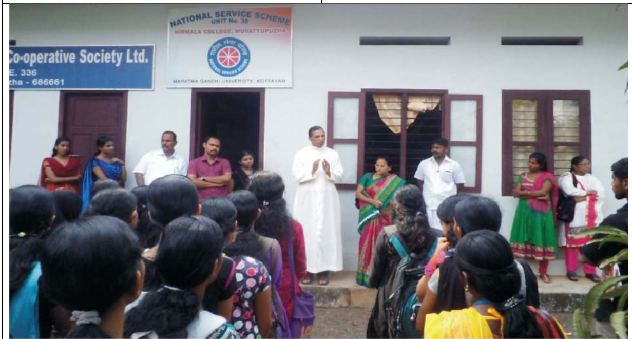
Awareness Program On Solid Waste Management At Nirmala College