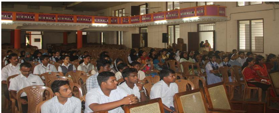
Students And Teachers From Various Institutions Participating The Training Programme