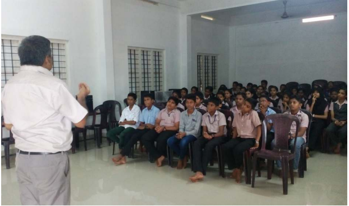
Awareness Programme In SH High Schools Ayavana