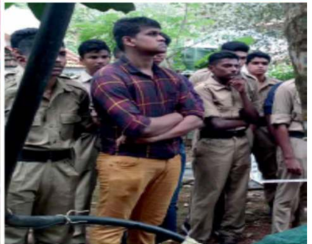
CHLORINATION OF WELLS AT AVOLY PANCHAYATH AND MUVATTUPUZHA MUNICIPALITY