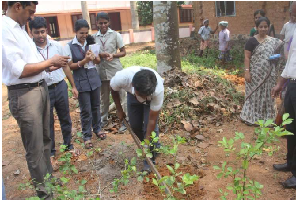
Students of Viswajyothy Engineering college are planting lemon plants