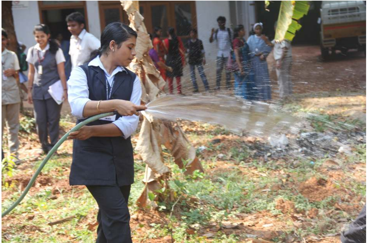
Students Keep On Watering The Plants In The Hot Months..