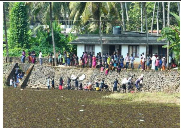
Cleaning Of Anikadu Waterbody