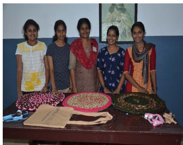
Workshop On Carpet And Cloth Carry Bag Making

The role of women as business owners is gradually increasing all over the world. Women entrepreneurship development is the instrument of women empowerment. In order to empower women through encouraging entrepreneurship. A Workshop on carpet and cloth carry bag making is another initiative of the Centre for Women Empowerment of the college. The programme was conducted with the assistance of experts from Kudumbasree, on which students as well as members of various Kudumbasree units actively participated. The workshop sensitised the participants about the ill effects of using plastic carry bags and trained them to make environment friendly recyclable carry bags by using both paper and cloths.