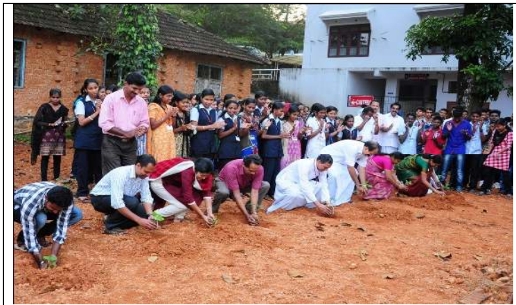
Inauguration Of The Project- Implantation

The 80 cents of land for vegetable cultivation was prepared by volunteers on 2 nd and 9 th November 2014. Volunteers ploughed the land and felled down the branches of the trees for easy getting of sunlight.