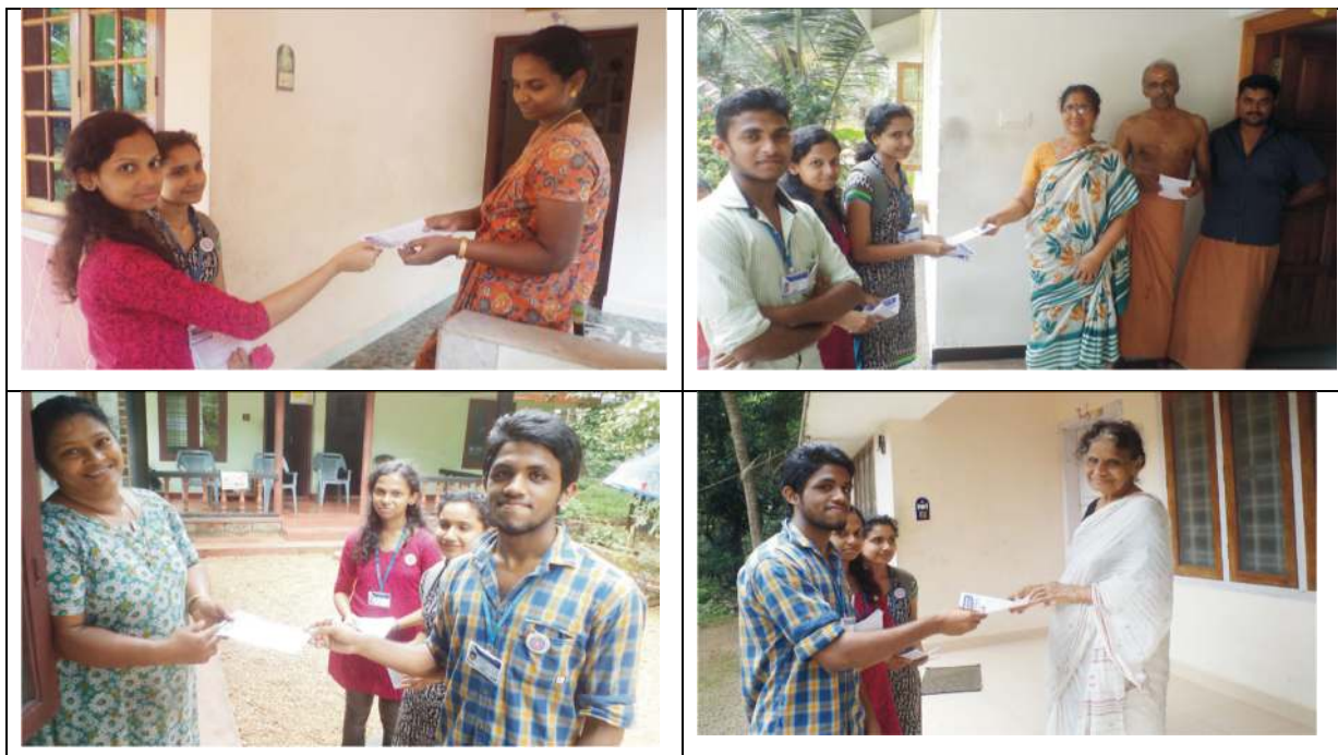
Awareness Programme Conducted In The Adopted Village, Avoly Panchayath