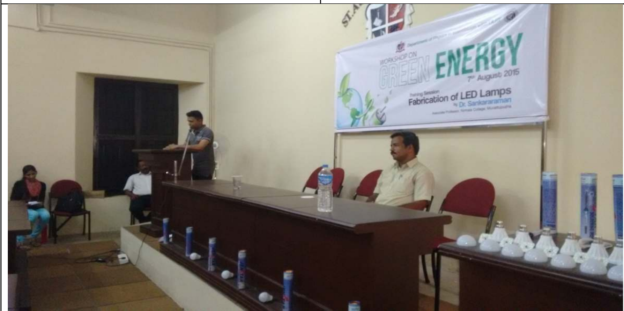
LED Fabrication Workshop At St. Alberts College Ernakulam