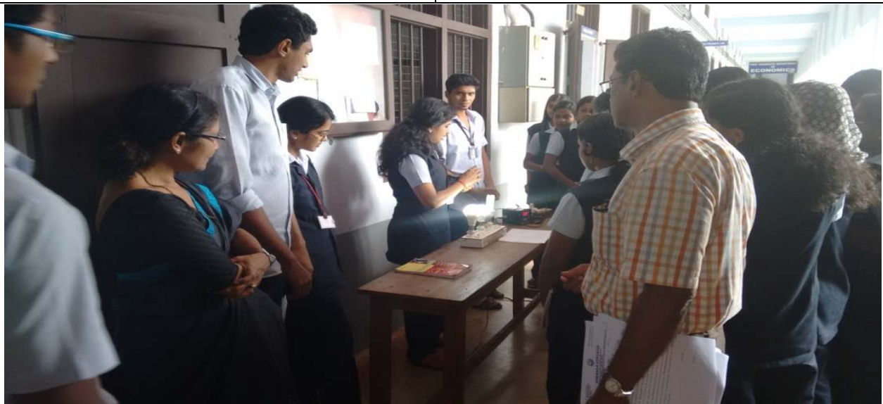
LED Fabrication Workshop At Nirmala College Muvattupuzha