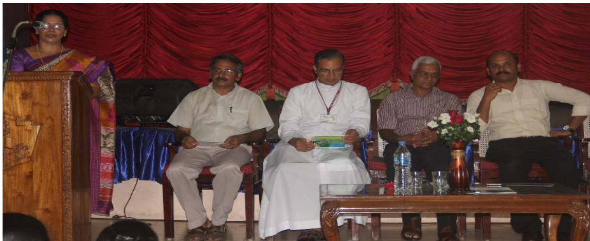
Inauguration Of The Butterfly Garden Training Workshop At Nirmala College Muvattupuzha