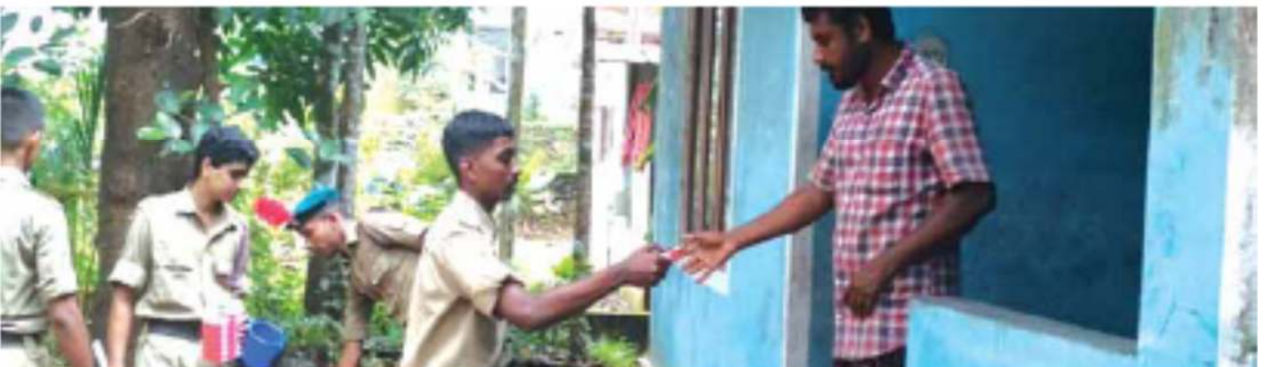
Distribution Of Medicines In Flood Affected Areas