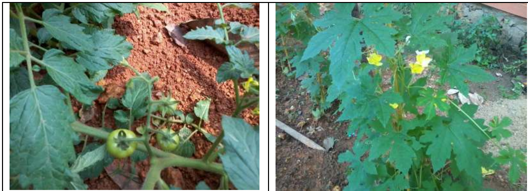
Flowering- A moment of happiness and hope

Along with them Basalla and Gaint Passion fruit were cultivated out of interest. Land was prepared in to ridges and furrows. In furrows cow dung was mixed and seeds of cowpea, Bhindi, Bitter gourd, snake gourd and sword bean were planted in furrows. Vegetables seeds and seedlings were obtained from AMPRS Odakkali. Seedlings of cabbage, cauliflower, chilli, brinjal were also obtained from the AMPRS. These seedlings were also planted in furrows. Amaranth seed was sown in the nursery. The plot identified for amaranth was kept vacant at that time and later transplanted the crop. Students watered the plants daily in the morning and evening. They were very much interested to see the growth of plants. The garden was maintained under organic pesticides only. Clean cultivation was practiced. Cow dung along with neem cake was applied at first earthing up. As prophylactic measure a prophylactic spray of pseudomonas 3ml/ltr and Beuvaria 3ml/ltr were done at quarterly interval. As a result no pest and disease problem was identified in the field