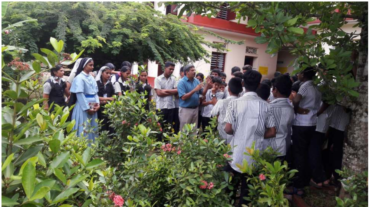
PI Is Interacting With The Students In Front Of Their Butterfly Garden