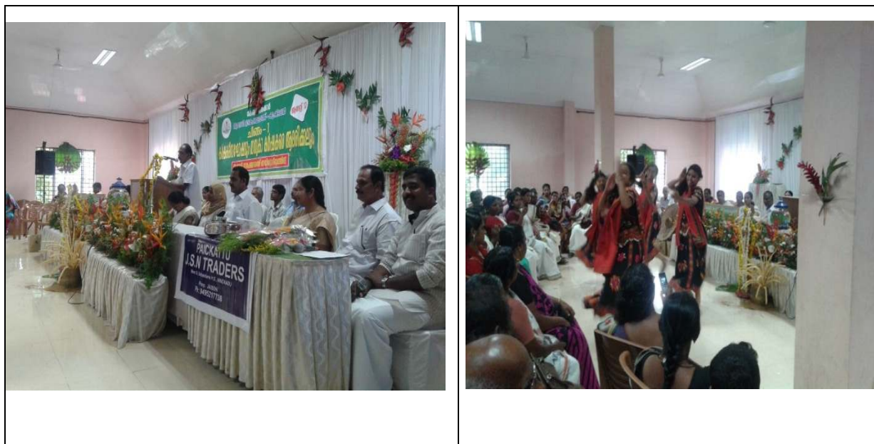
Celebration Of Farmers Day by the NSS unit of Nirmala College

As part of Chingam 1 st celebrations, the NSS unit of Nirmala College celebrated farmer's day in the adopted village, Avoly. It was a joint effort of Avoly Gramapanchayat and the NSS Unit of Nirmala College. The farmers were honoured during the programme. Mr. Joseph Vazhakkan, MLA, Muvattupuzha was the chief Guest of the function. He delivered a speech on the importance of farming. He compares the previous farming practices and the modern practices. He insisted farmers to utilize the modern farming practices. The volunteers performed various cultural events during the occasion. The farmers of Avoly Panchayath gets through this programme.