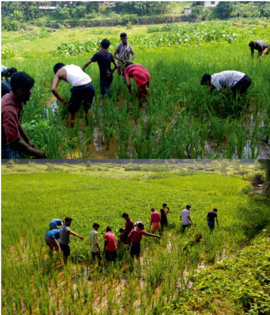
Stage 4-Paddy Cultivation; Weeding

The volunteers were not ready to relax or step back from their aim, even though the weather was tough. There was continuous search by the volunteers for a better and possible option to restart the farming. This search led to finding of seedlings on a Land area. The next stage was transplanting of this seedlings to the field. The field was once again worked out after the heavy rain, and then transplanting of seedlings started. At the time of transplanting, the seedlings were 9-11 inches tall. Paddy field had to be flooded and the soil must turn soft to accept the seedlings. A large group of volunteers gathered in a long row across the field, standing in water and each carrying a handful of seedlings. Everyone planted one row of seedlings in the row, and then stepped back one step and planted the next row. The transplanting was a tedious and planned work.