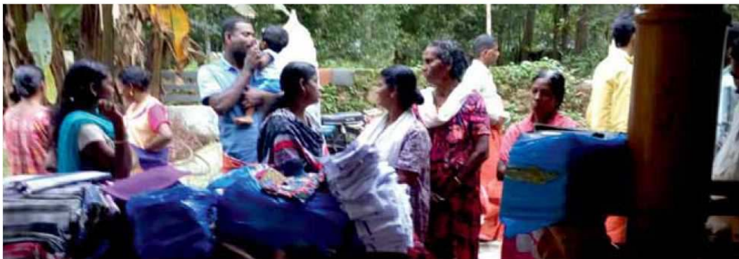
Large Scale Distributions Of Flood Relief Materials – Aluva And Chengannur