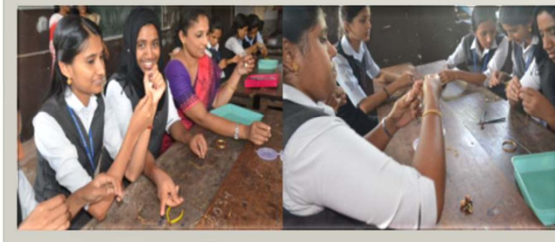
Entrepreneurship Development Workshop On Ornament Making

Workshop on ornament making has been organized by the women empowerment cell of the college in collaboration with Manna coaching Centre, Muvattupuzha on 22 nd January 2017. This training was mainly for those students especially women, interested in jewellery design and making. The workshop includes sessions on techniques used in designing and making exotic jewellery. Even the participants who were completely new to jewellery making were educated in the art of making basic jewellery structures and jewellery assembling. Acquisition of this additional skills make the women self-reliant and also help them to earn an additional income for their livelihood.