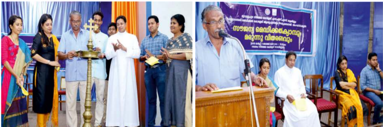
SANJEEVANAM - FREE MEDICAL CAMP