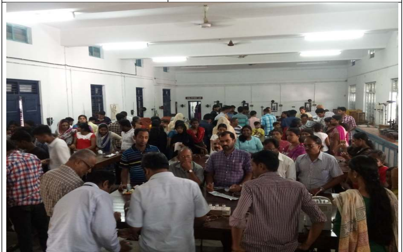
LED Fabrication Workshop At Cochin College, Ernakulam