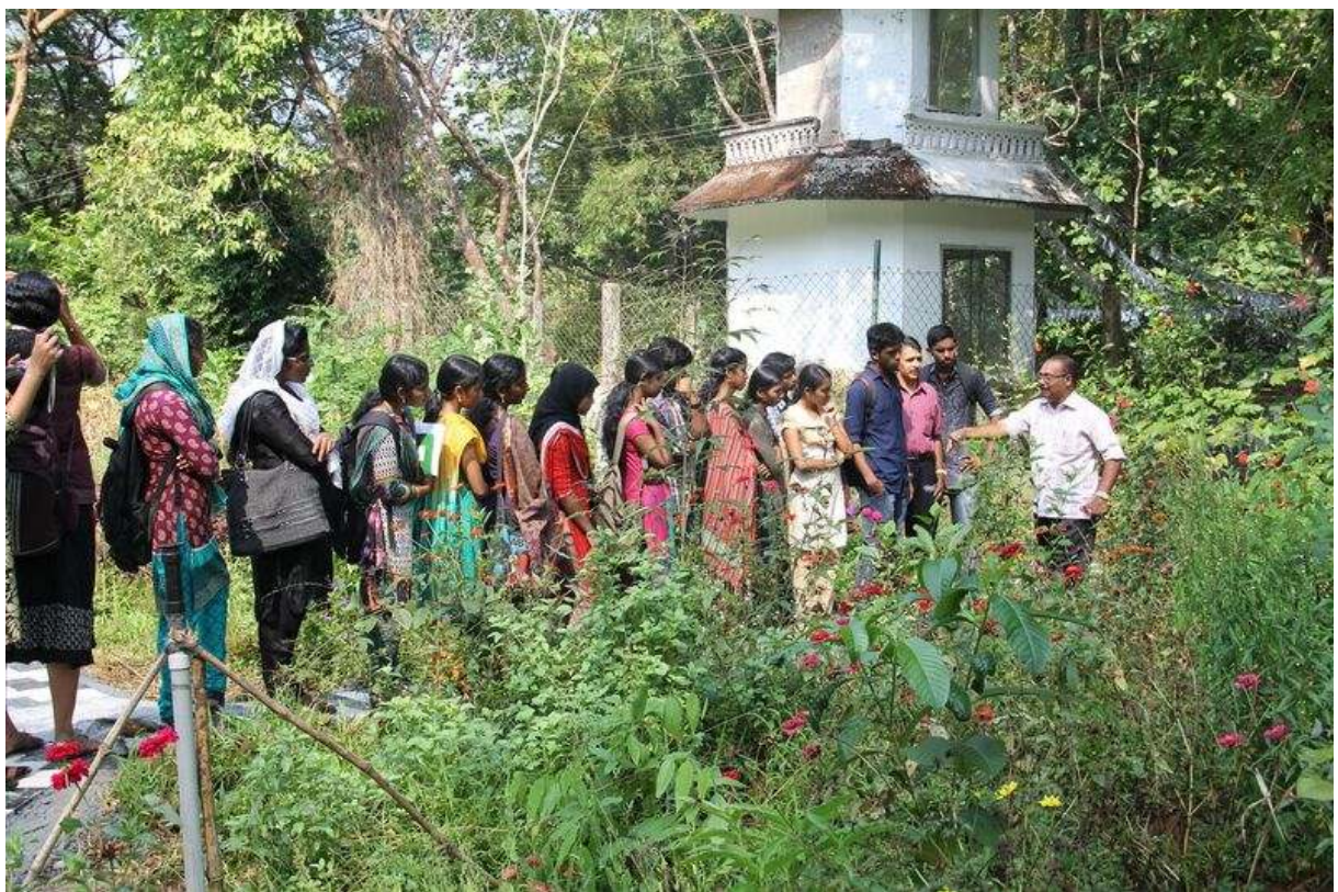
Students Visit A Butterfly Garden At Thattekkad WLS