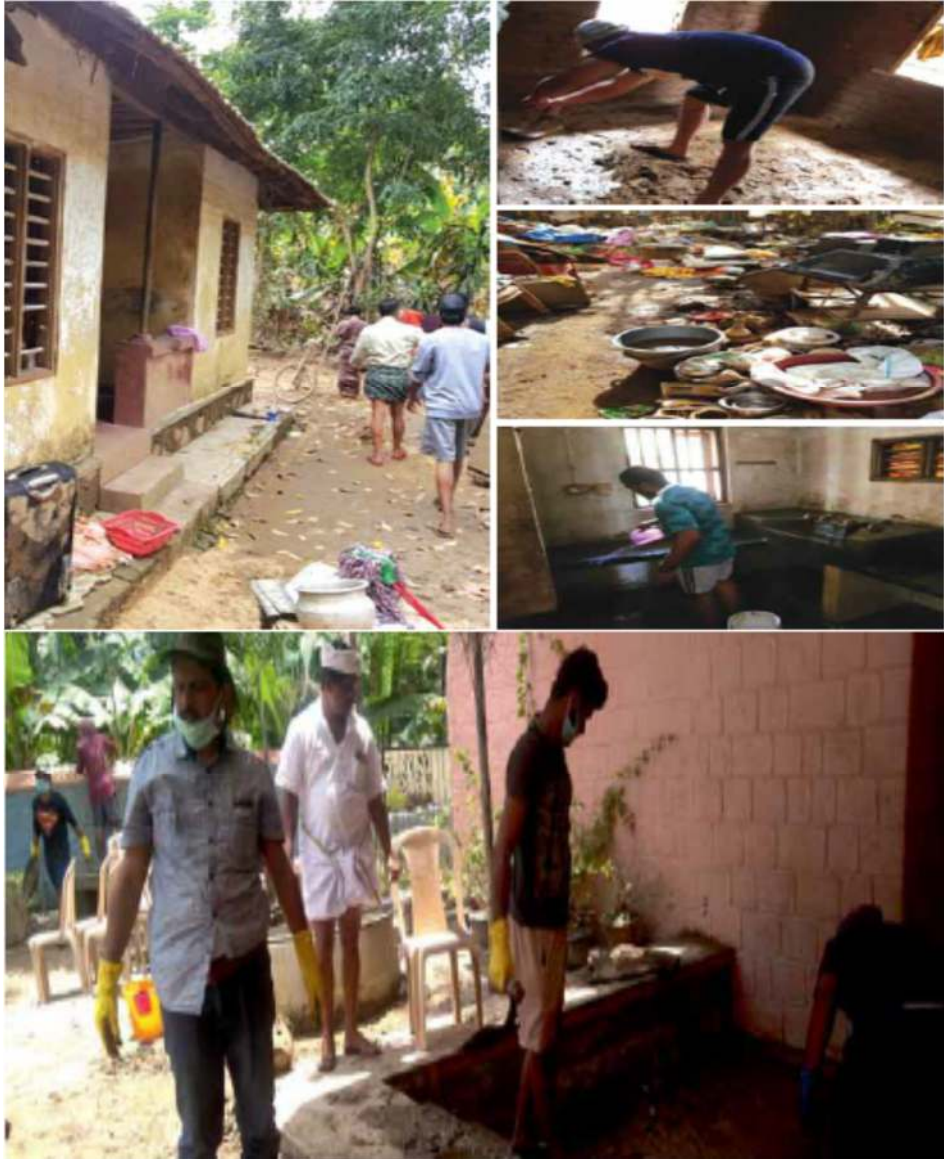
Flood Relief Operations Cleaning At Chengannur