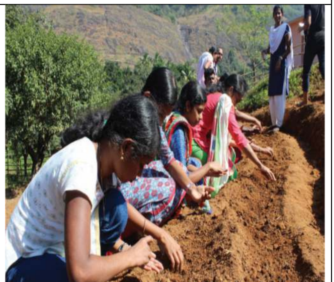
Organic Farming An Initiative Of NSS Volunteers Of Nirmala College