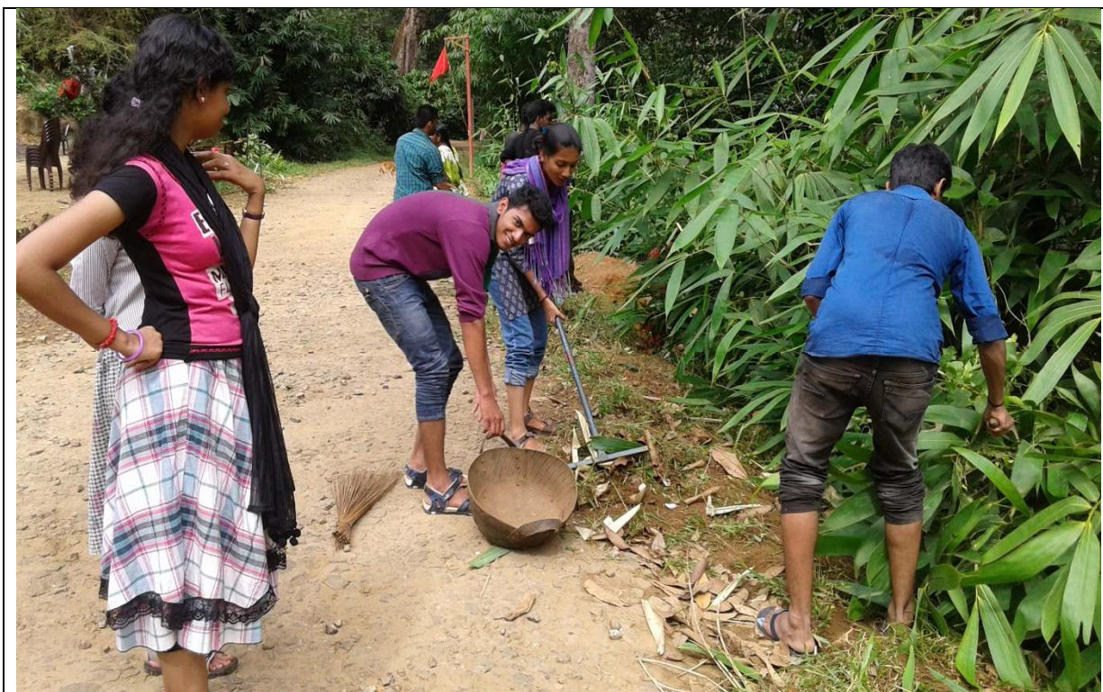
Renovation Of Rural Roads In Vellaramkuthu Tribal Settlement

Improper road connectivity is one of the main reasons stopping growth in rural areas. As a part of improving the lives of people in tribal areas, the NSS unit of Nirmala college renovated the rural roads in Vellaramkuthu tribal settlement on 20-12-2014.