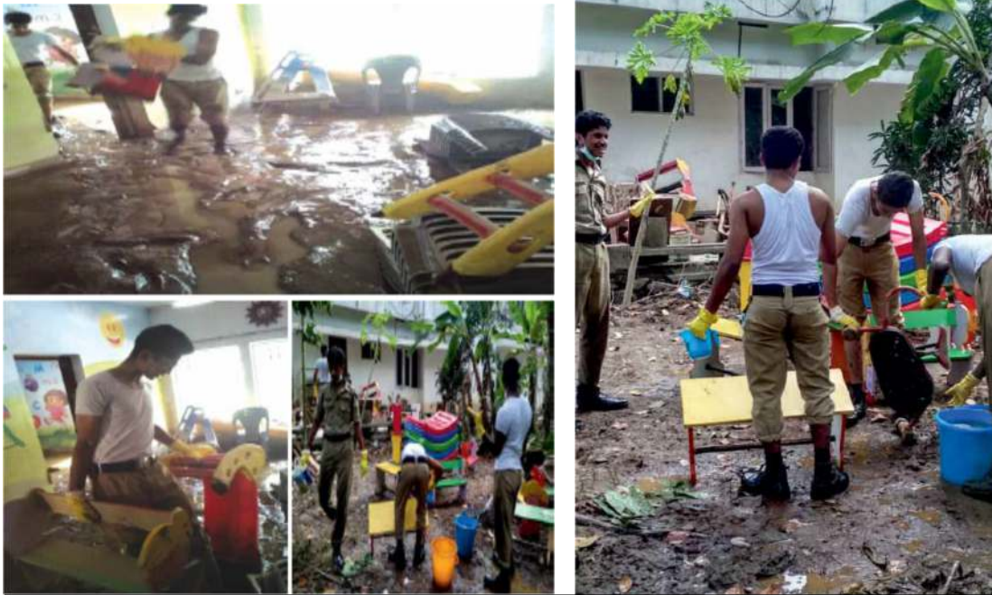
Flood Relief Operations And Cleaning At Chengannur

A team of NCC cadets visited Chengannoor, a flood affected area on twenty sixth of August, 2018 for flood relief activities. The cadets were given precautionary medicines and safety equipments like hand gloves and masks. The team was split up into sub groups. The 6 NCC cadets were put together in a single team. They went to clean the anganvadi and kindergarten schools at Chengannoor. The team successfully in cleaned up 3 institutions and power supply was re-established. In the evening, the local people gathered together at the nearby church and conveyed their sincere thanks to the whole team.