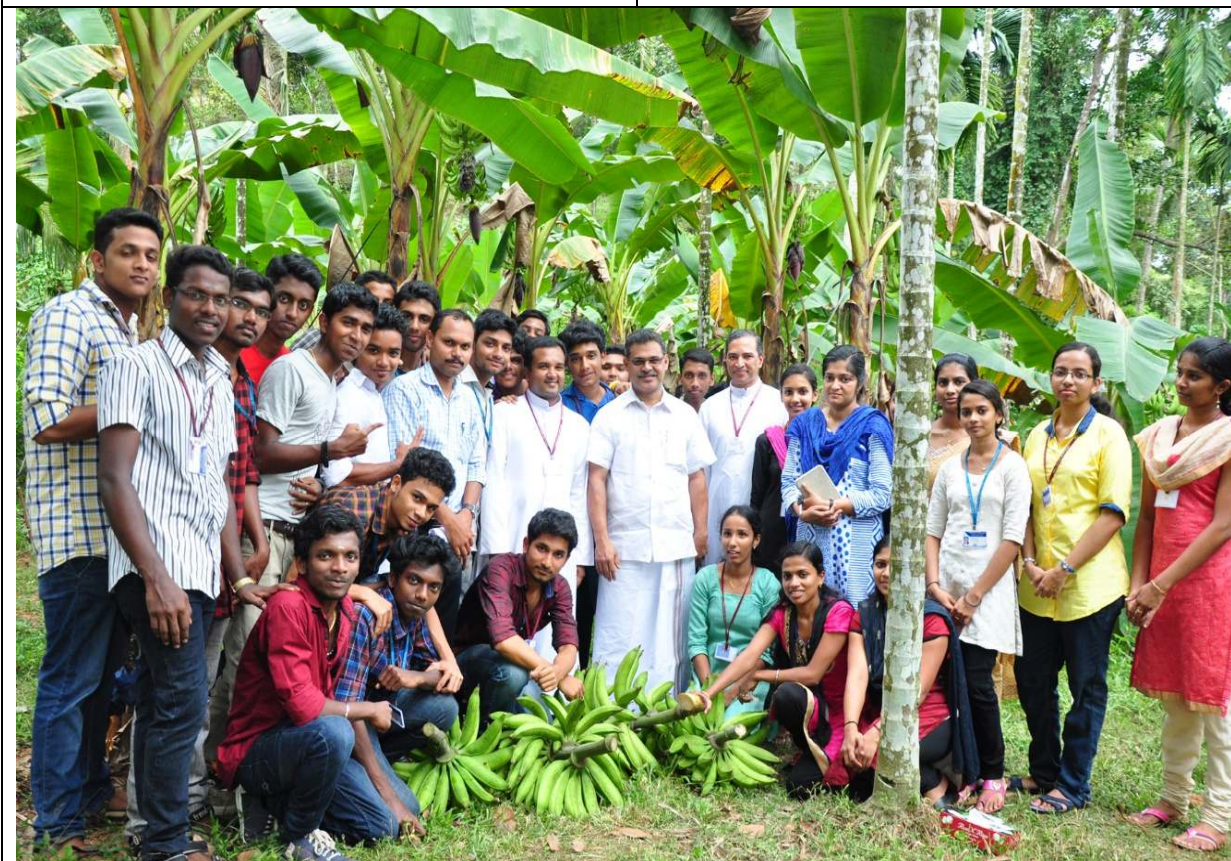
Banana Cultivation And Sale By The NSS Unit Of Nirmala College