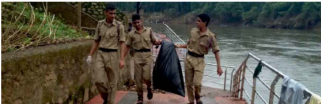
Cleaning Of Muvatupuzha Riverside Walkway By NCC Cadets

Twenty NCC cadets of Nirmala College participated in cleaning the walk-way of Muvattupuzha riverside walkway". It was filled with plastic waste and rubble. The cadets went and collected plastic waste in separate bags so that it can be used for recycling. Reusable waste was collected and handed over to municipal cleaning staff. Fire and rescue team also participated in that event and encouraged the cadets. The station in charge thanked Nirmala College cadets for cleaning the waste on the walkway of the riverside.