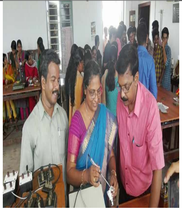
LED Fabrication Workshop At St Stephen's College Uzhavoor