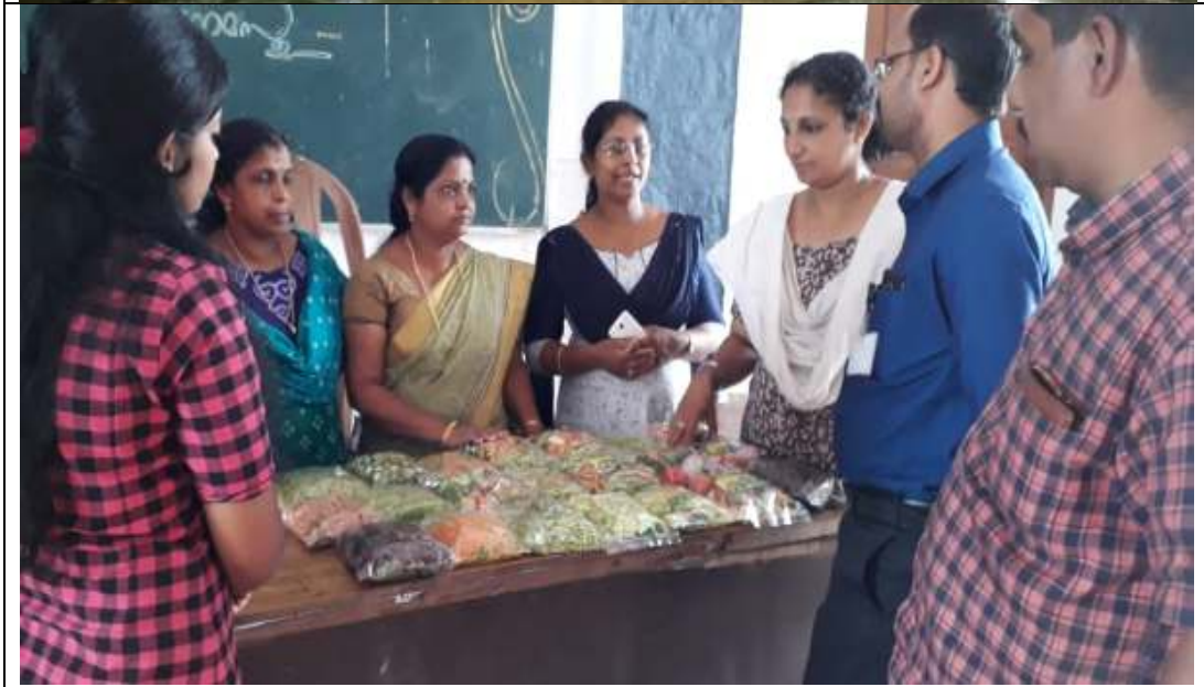
Providing Space For Kudumbrasree Unit To Sale Cut Vegetables In The Campus