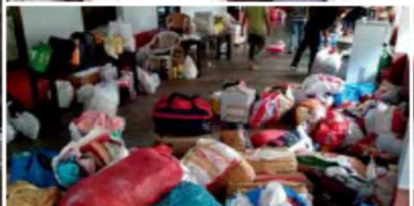
Large Scale Distributions Of Flood Relief Materials At Cheruthoni And Chalakkudi

Students of Nirmala College supplied flood relief materials to several camps in flood affected areas of Cheruthoni (Idukki), Chalakkudy (Thrissur).