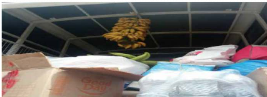
Organising Relief Camp Shifting Patients From Hospital To Camp

Due to flooding, the hospitals in Muvattupuzha stopped functioning and sent them to their houses. The NCC cadets went to hospital and brought those who lost their houses in the flood to the camp. People with serious medical illness were moved to other hospitals by ambulance. The Muvattupuzha RDO visited the camp and gave necessary directions for the conduct of the camp. The health inspector and health supervisor of Avoly panchayath visited the camp along with a doctor. Various NGOs, various religious organisations and people of goodwill supplied materials such as groceries, sanitary napkins, baby napkins, baby food, bags, candle, medicines and old and new dresses. There were a total of 191 refugees in the third day of the camp.