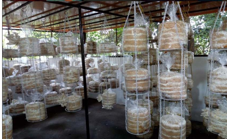
Mushroom Cultivation By The Undergraduate Students From Dept. Of Botany