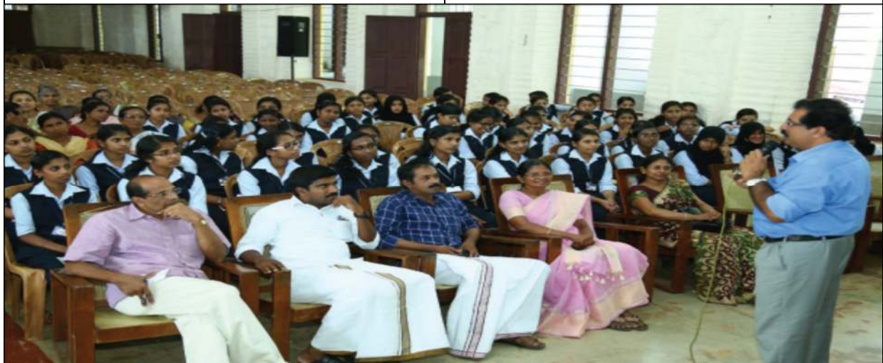
Seminar On E-Waste Management