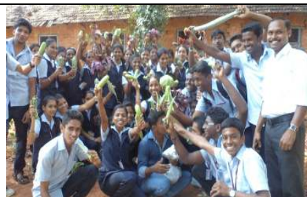
Vegetable Harvesting – Harvest Fest