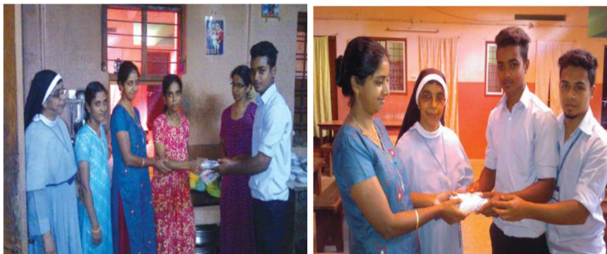
Mid-Day Meal Programme by NSS Unit, Nirmala college

As part of Gandhi Janyanti celebrations NSS Unit observed SEVANAVAARAM in the first week in October 2015. During this week unit collected food packets from the students of Nirmala College and served it to the nearby orphanages. Volunteers from different department collected food packets on the day assigned to them. So, this made participation of students and teachers from each and every department to this programme.