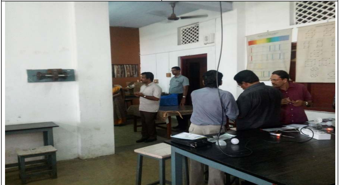
LED Fabrication Workshop At Baselius College, Kottayam