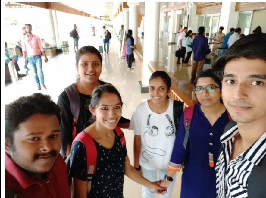
CIAL Learning Programme

The objective of the programme is to create a bridge, a platform for the students to work in cross functional teams with a broad objective of enhancing their leadership skills and giving back to the nation. In the process, the students work in leadership roles while operationalizing projects that