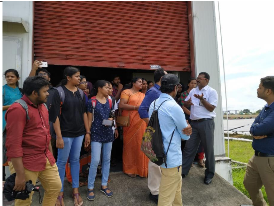
CIAL Learning Programme