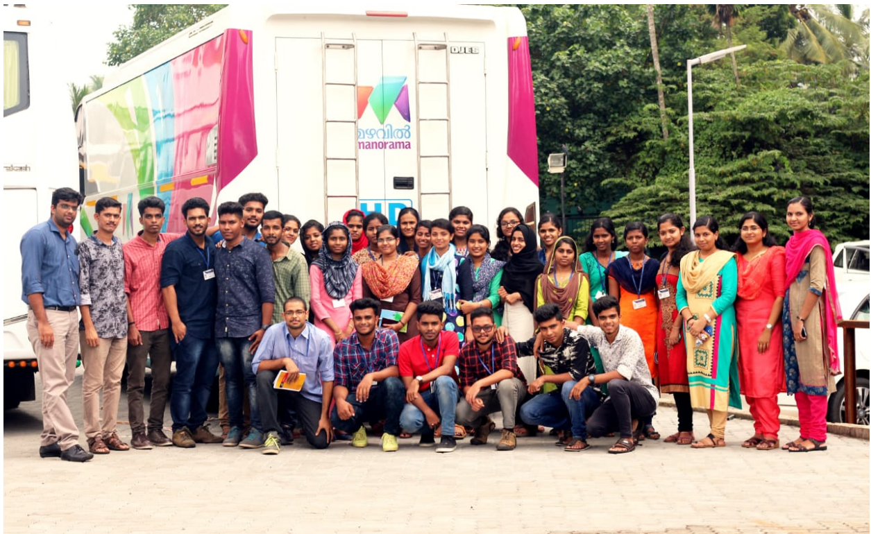
Mazhavil Manorama studio visit by III DC Communicative English

To familiarize the students with studio and associated techniques of broadcasting the department of communicative English gave an opportunity to the third year B.A. English Model III students to visit the Manorama News and Mazhavil Manorama Studio, Aroor, Kochi on 28 July 2018. During the visit technical experts explained the different television broadcasting processes to students. This experience was indeed helpful to boost up their interest in the field of visual media. It also helped them to know about various aspects of news reporting that enabled them to bring curriculum back to their real life. All the students of the class actively participated in the program and clarified their doubts regarding visual broadcasting.