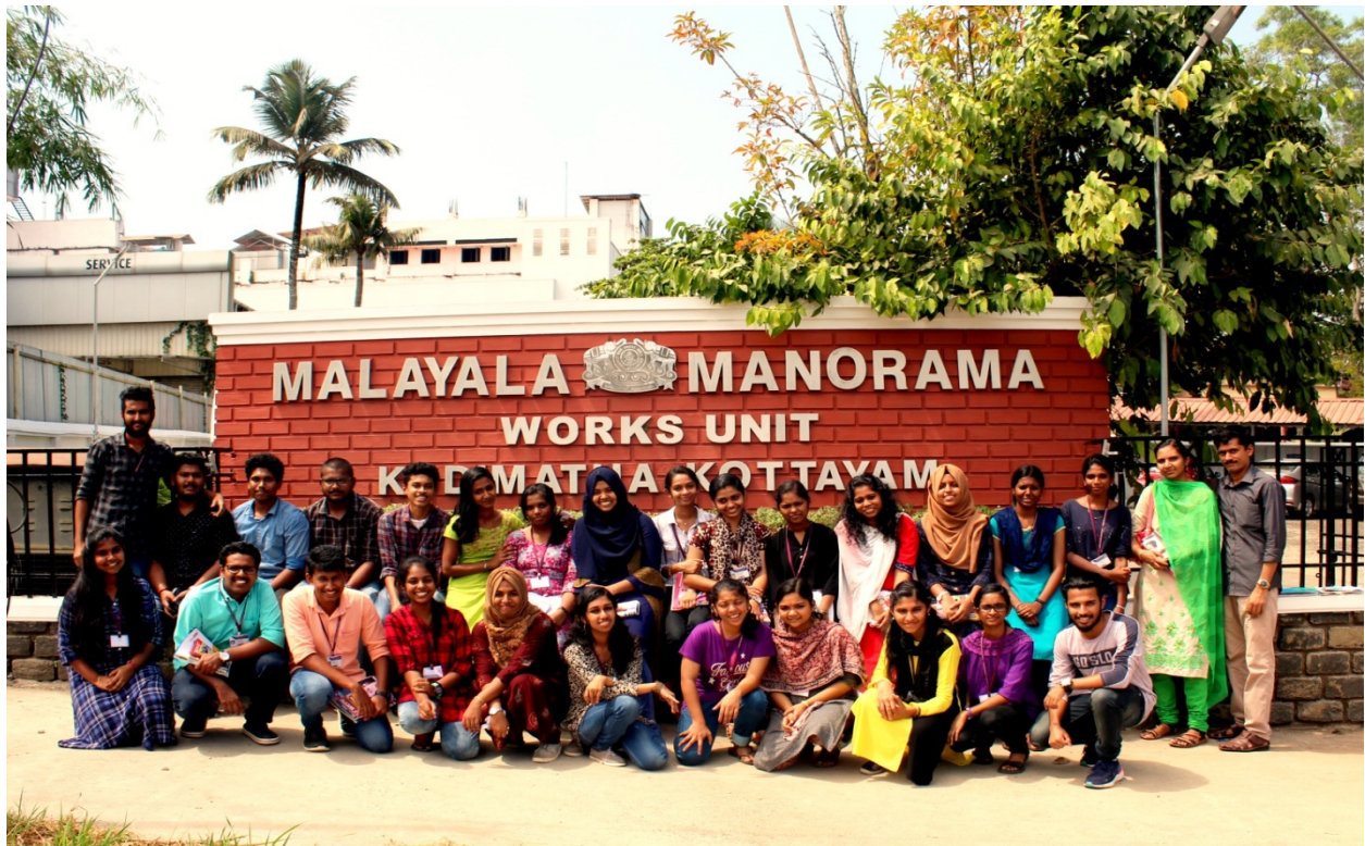
Malayala Manorama press visit

Print Media and Journalism is indeed a course that demands both theoretical and practical knowledge in printing and associated activities. Recognizing this the Department of Communicative English had given an opportunity for experiential learning to the II CE students. The faculty and students visited the Malayala Manorama Press, Kodimatha, Kottayam on 04 February. During the visit the students got familiar with different aspects of printing like the techniques for multiple printing, screen printing, 3D printing, flexography, fabric banner, posters inkjet printing etc. The programs was helpful to nurture interest in the area of journalism and print media among the students.