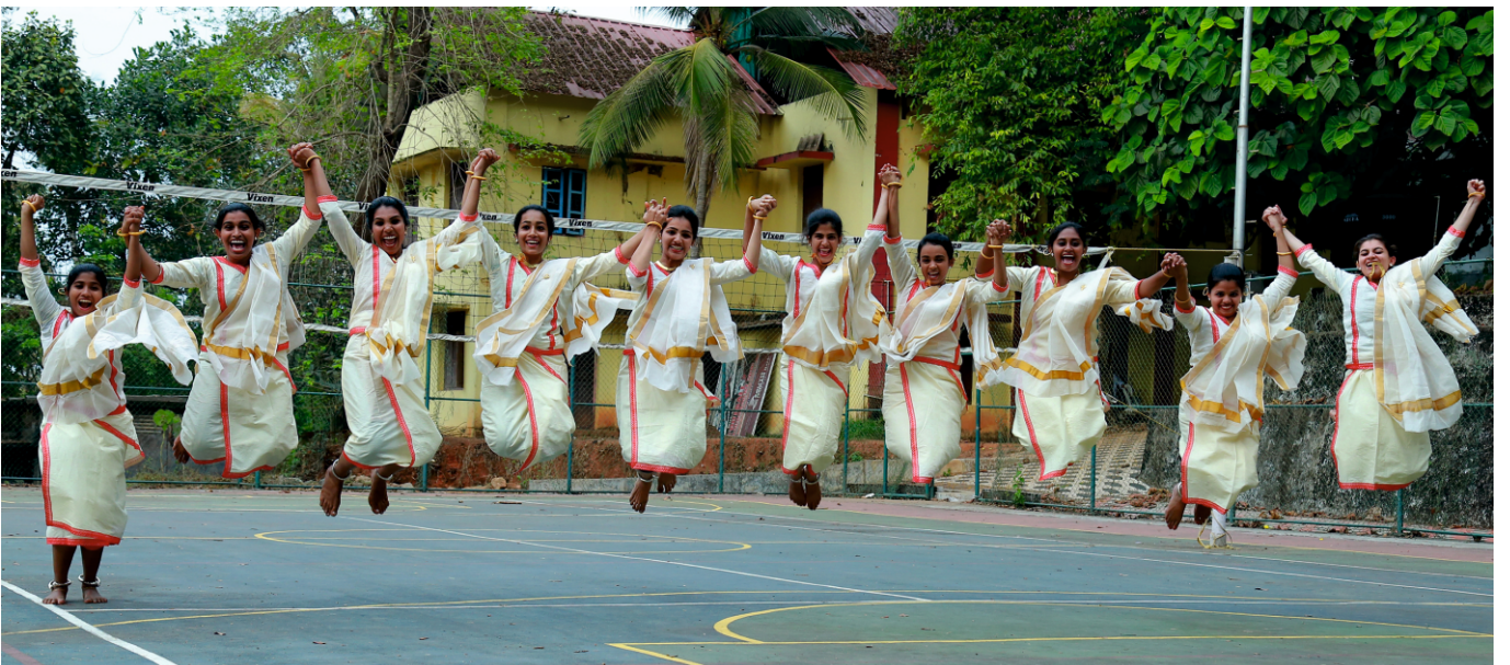
Margamkali Team bags 1 st prize MGU Youth Festival 2018