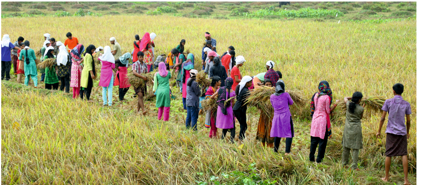
Students engaging in Organic Farming