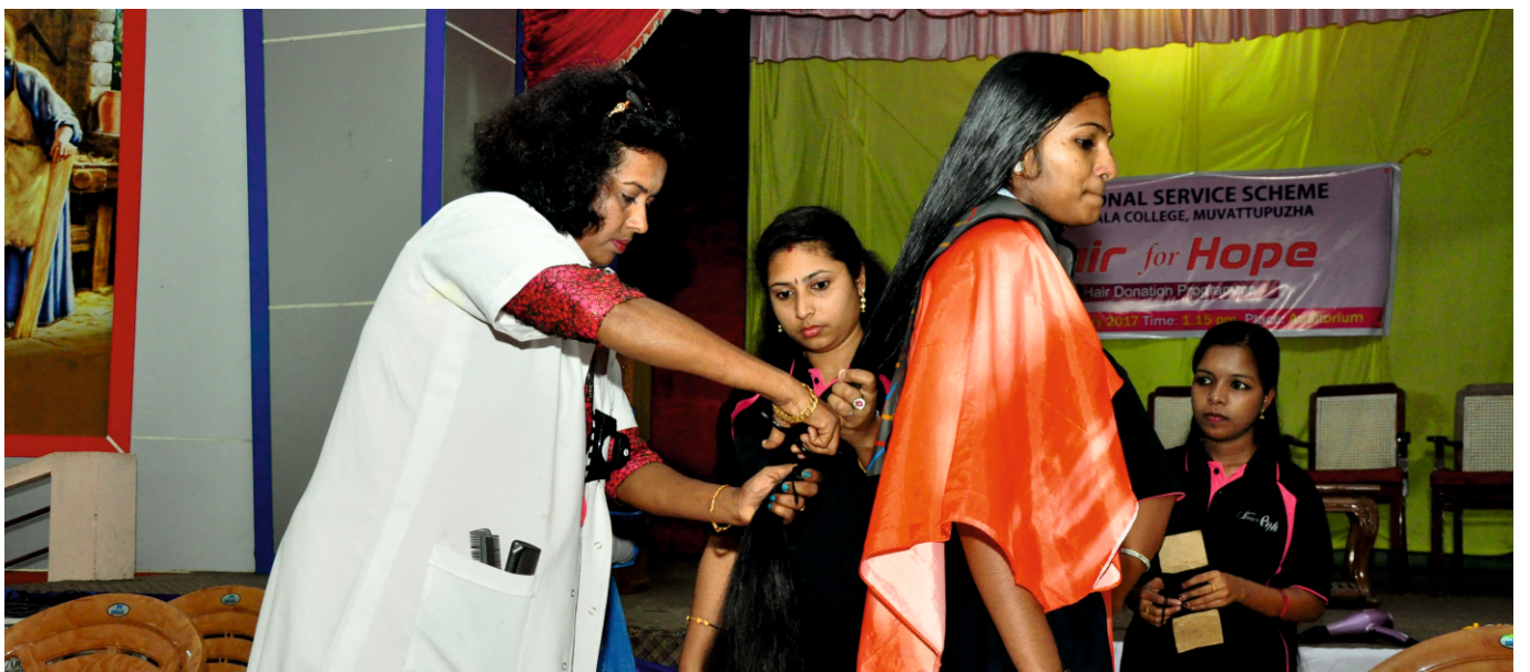
Students donated hair for cancer patients.