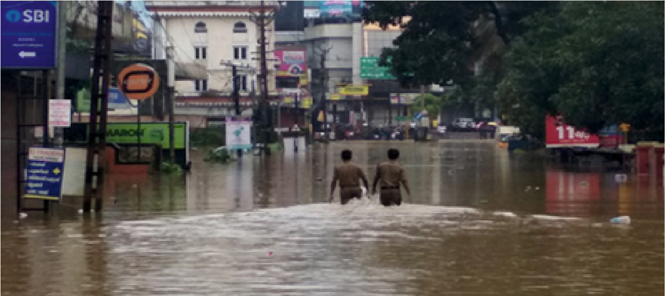
Students in Flood Relief operation