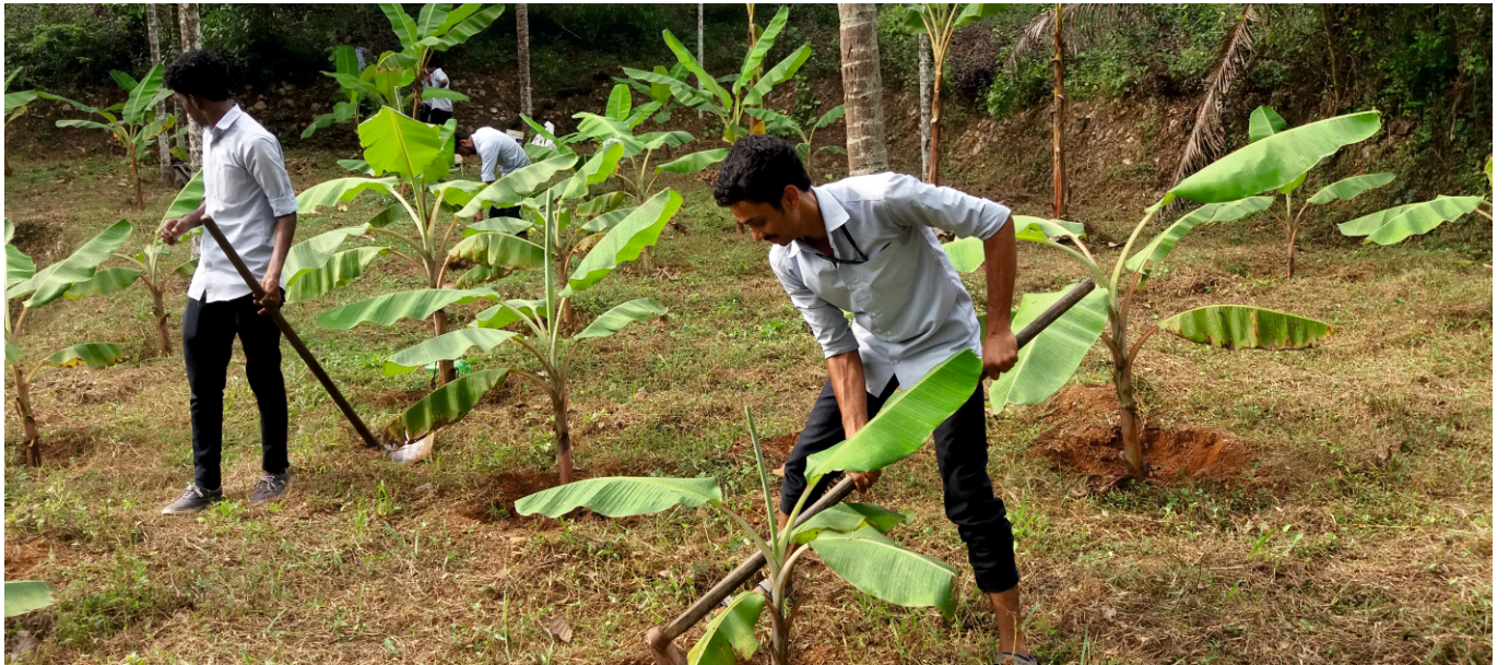
NSS Volunteers in their Organic Farm