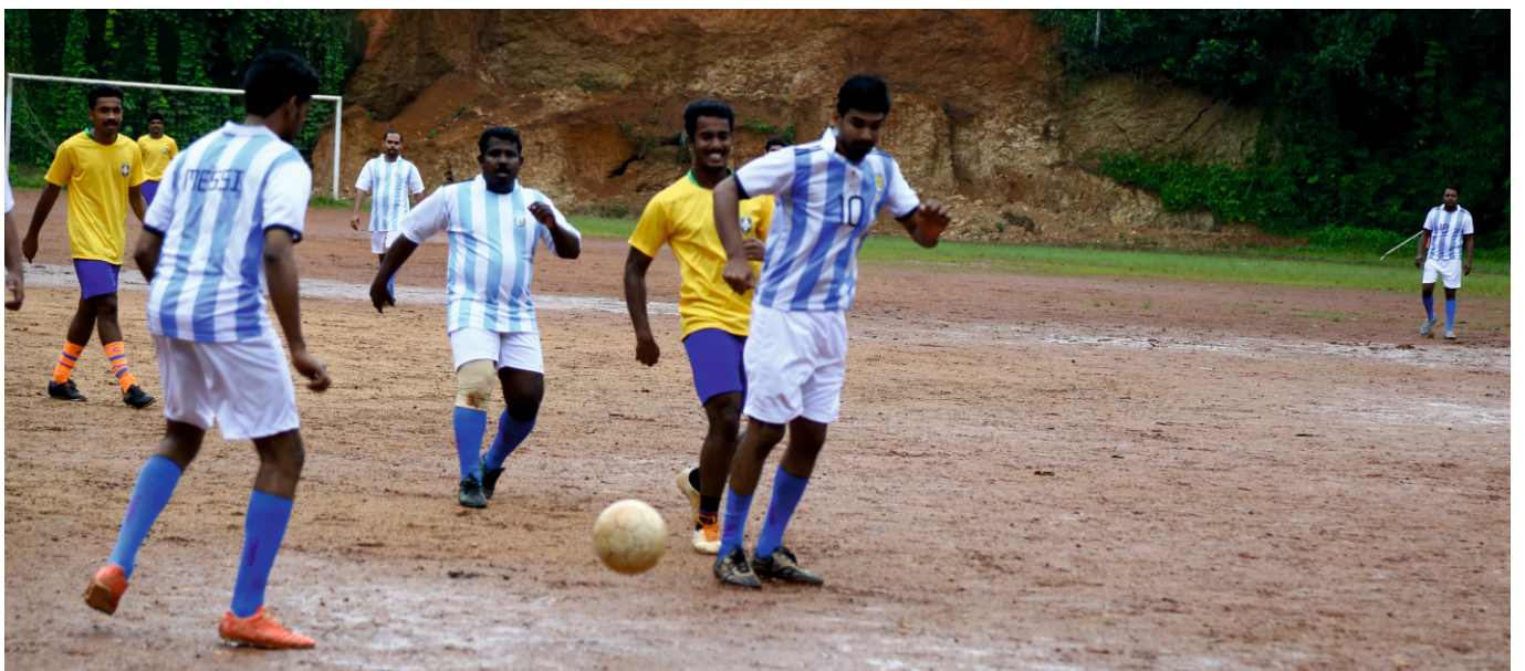
Students and Teachers in a friendly football match