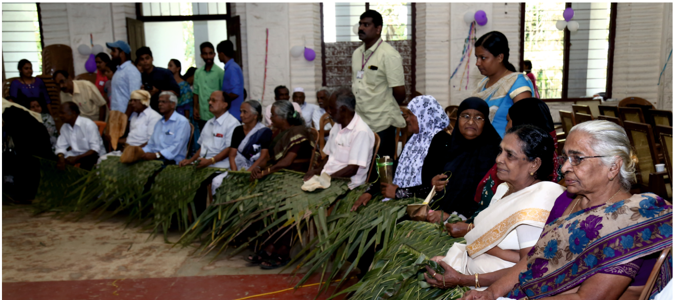
Vayomithrem 2017 from the gathering of Senior citizens