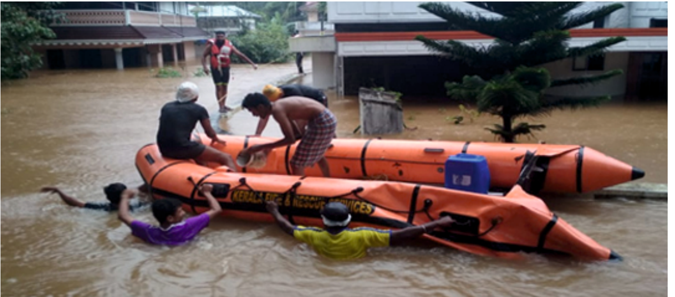
Students in Flood Relief operation