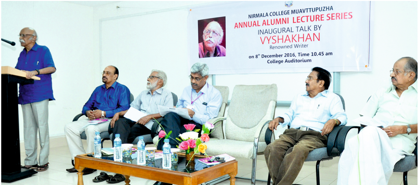
Sri. Vyshakhan, President, Kerala Sahitya Academy delivers Annual Alumni Day Lecture