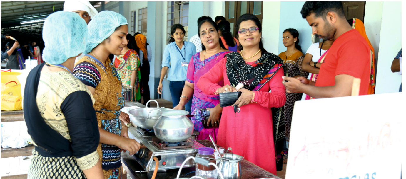
Scenes from Food Festival