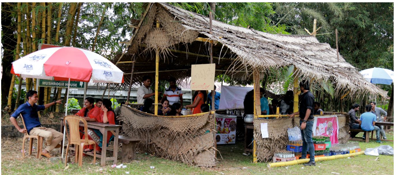
Scenes from 'Paithrukam' Exhibition