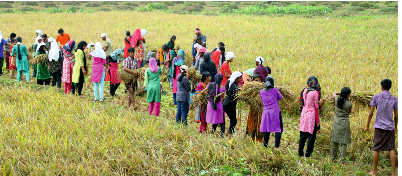
NSS Volunteers engaging in organic farming