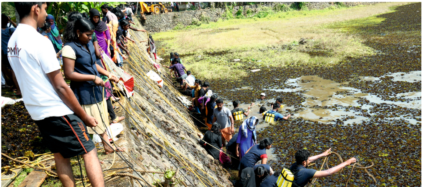
NSS Volunteers in action: Cleaning the Anicadu chira