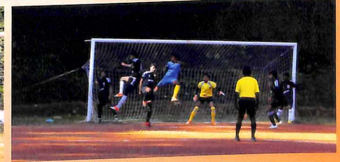
Nedumkallel Memorial Football Tournament