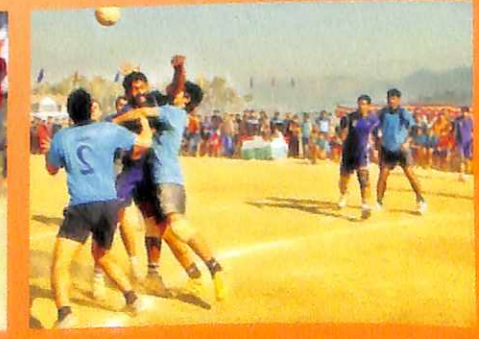
M.G University Inter Collegiate Tournaments