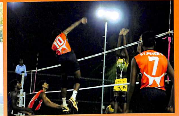
Prof .George Paul Memorial Volleyball Tournament