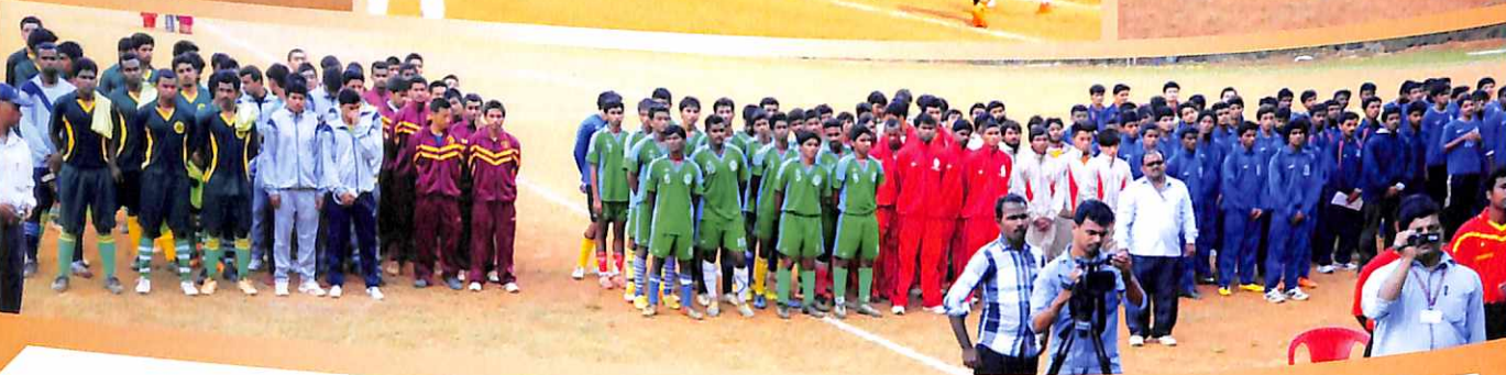
All India Inter University Football