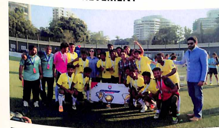
Football All India Reliance Youth Foundation National Football Championship 2017 - Runners up