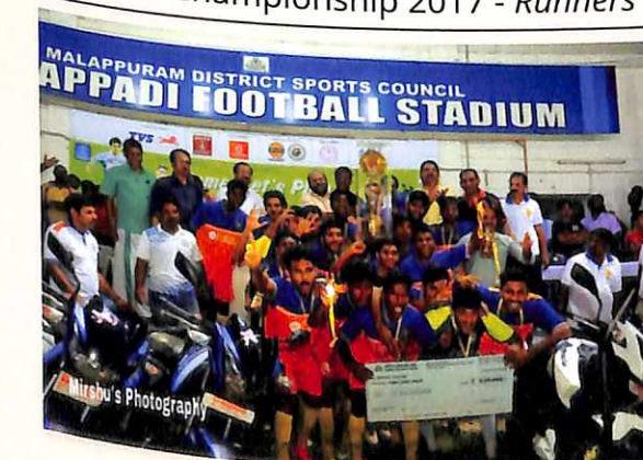
New Indian Express Goal 2017, South Indian Football Champions